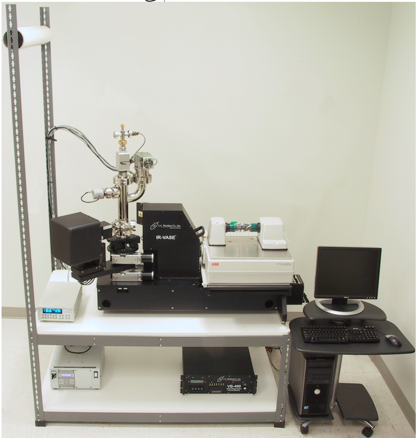
Figure 1 IR-VASE with cryostat option on supplied table.